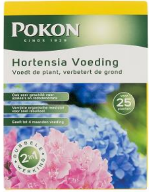
(GTIN)_C1N1 Product image/Front face/ No plunge angle/In packaging