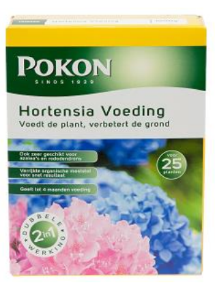
(GTIN)_C1C1 Product image/Front face/ Front/In packaging