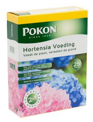
(GTIN)_C1L1 Product image/Front face/ Left/In packaging

N.B. (GTIN) in the examples represents the product's GTIN (14 characters).