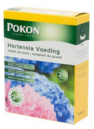
(GTIN)_C1R1 Product image/Front face/ Right/In packaging