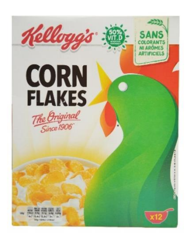
Fig. 2.1: Straight-on front

Multiple images can be exchanged, but it has been decided in this industry to photograph each product at least once straight-on front as sold in the store (packed products in the packaging), with a plunge angle of 0°.