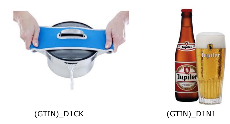
Fig.4.6: Product image with supporting elements