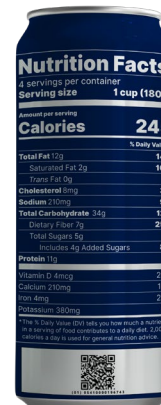
As from 2028: - linear barcode alone, or - next gen barcode alone

The goal of this implementation guide is to provide guidance on what the next generation of barcodes means for retailers, which advantages it has and how they can prepare for the implementation. This implementation guide is a summary for retailers of the detailed international Implementation Guide .