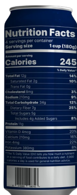
Before: linear barcode

This transition period is temporary and, by the end of 2027, only one barcode may remain on the label. However, this next generation barcode is not mandatory for suppliers, so the traditional linear barcode can and certainly will continue to be used in some cases.