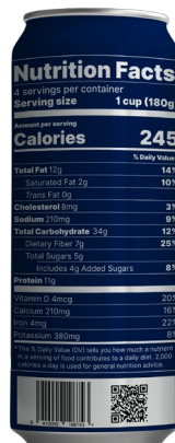
Now until end 2027: - linear barcode alone, or - linear & next gen barcodes